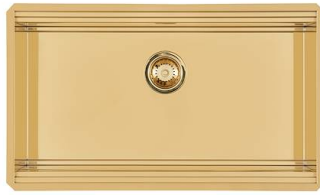
Sink Milanello Gold Workstation 1034 859